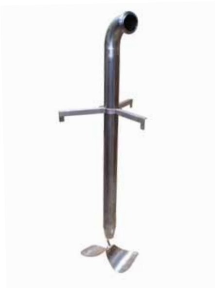
Optional Support Frame